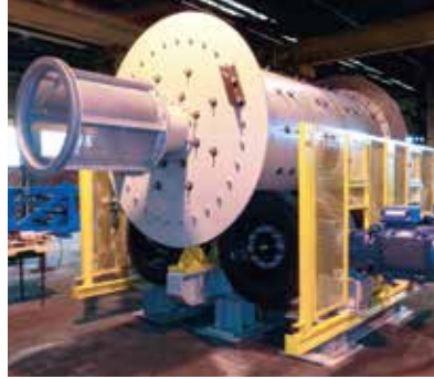
1.5 x 3.6 Sepro Ball Mill