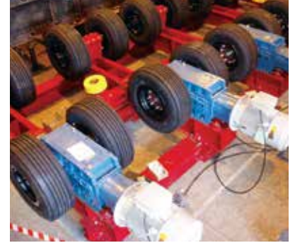
Sepro Pneumatic Tyre Drive System (PTD)