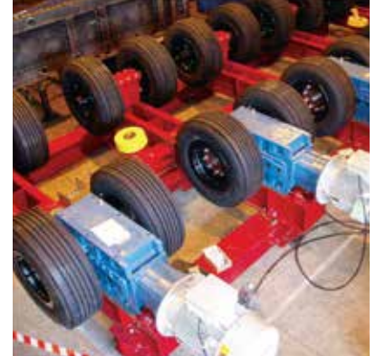
Sepro Pneumatic Tyre Drive System (PTD)