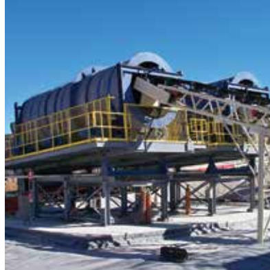
3.0 x 9.5 Sepro Agglomeration Drum

Note: Specifications are job/project dependent and/or application specific. Please check with Sepro sales representative.